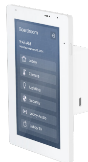
IST-5-W (White Bezel)