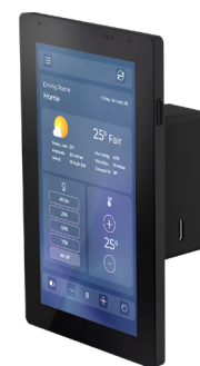
IST-5-B (Black Bezel)