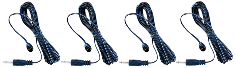
Four (4) IR Emitters included.

For additional control flexibility, the ProLink.r provides one-way LAN control via iPad® and iPhone® with the FREE ProPanel app license. (The ProPanel app is available on the App Store.®)